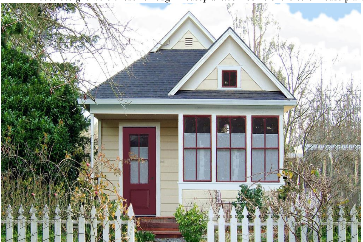
A cozy 310 square foot cottage with an appealing front stoop and a bump-out with several antique style paned windows

House designs were chosen through Houseplans.com some of the other house plans are: