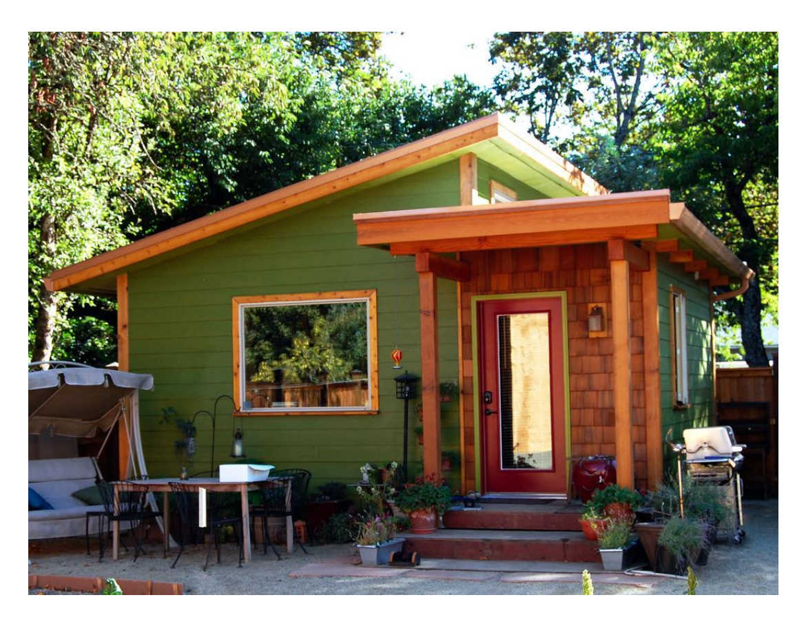
A 320 square foot modern style cottage with a nice front porch, an L shaped kitchenette and clearstory windows for added light.