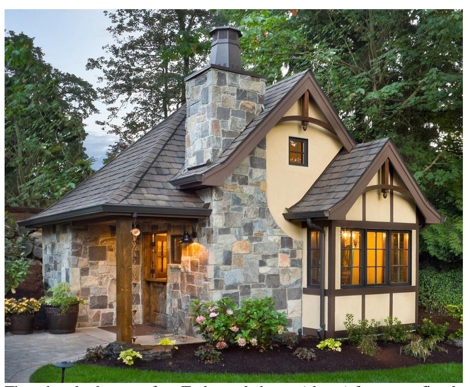
Three hundred square foot Tudor style home (above) features a fireplace, large front window and spacious back deck for outdoor living space.

Each residence is totally different because most of the residents are coming from institutions like homeless shelters or senior apartment buildings where everything looks exactly