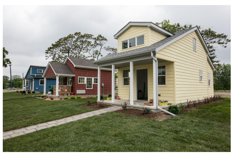
Another Tiny Home built in the Cass Community (above)