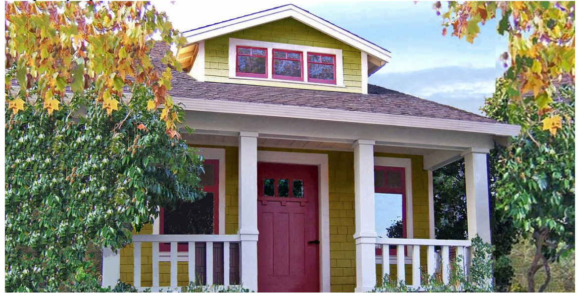
A 356 square foot shingled bungalow with a neighborly front porch, an open feeling and lots of light.